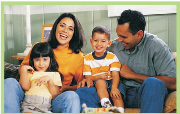
The Sarasota County Health Department has three Children's Health Centers - one in Sarasota, Venice and North Port.

We accept some private insurance and most Medicaid plans, including: