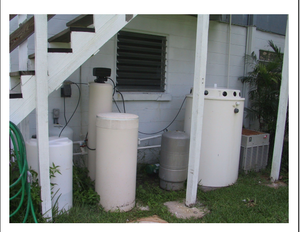
Published by the Water Section of the Sarasota County Health Department

Sarasota Office Telephone: (941) 861-6133 Fax: (941) 861-6152